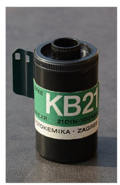
efke B&W film cartridge