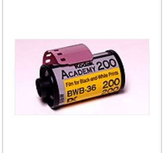
Kodak Academy 200