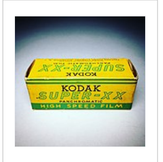
Kodak Super-XX Panchromatic High Speed 120 Film (Expired December 1939)