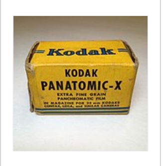
Kodak Panatomic-X 35mm Film (Expire July 1944)